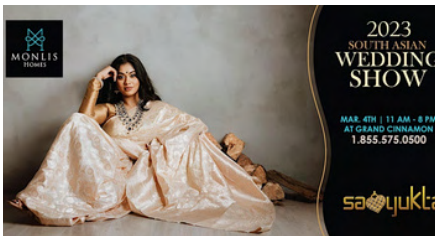
Samyukta Wedding Show 2023