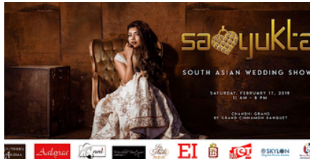
Samyukta Wedding Show 2018