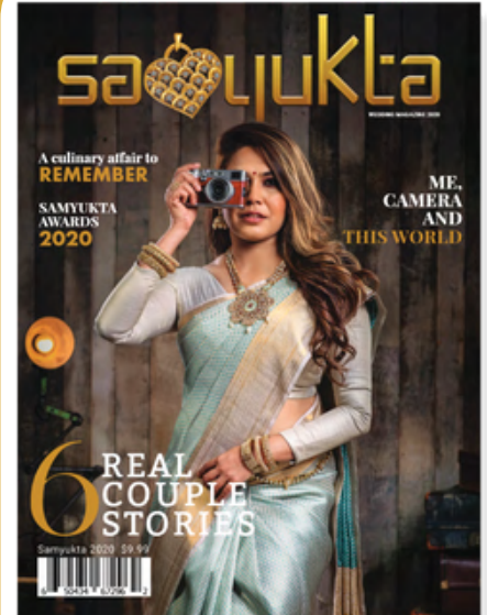
Samyukta Wedding Magazine 2020