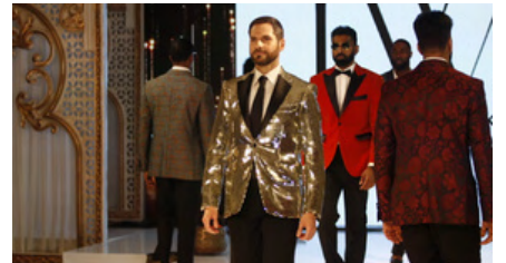
Samyukta Fashion Show 2020