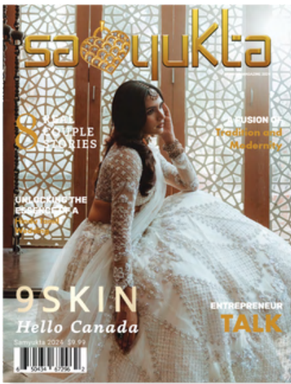
Samyukta Wedding Magazine 2024