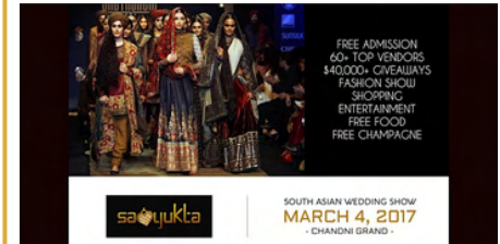
Samyukta Wedding Show 2017