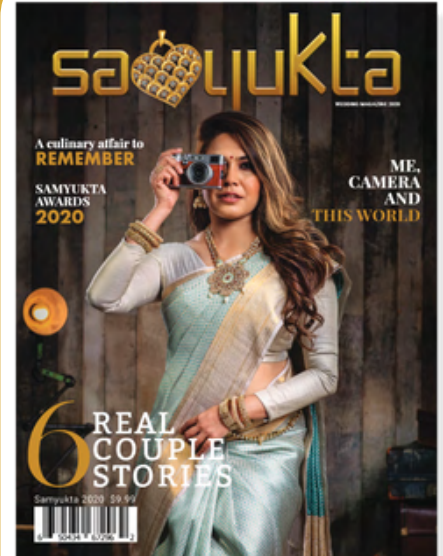
Samyukta Wedding Magazine 2020