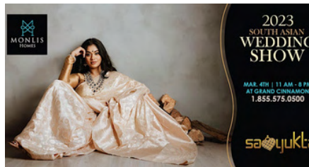
Samyukta Wedding Show 2023