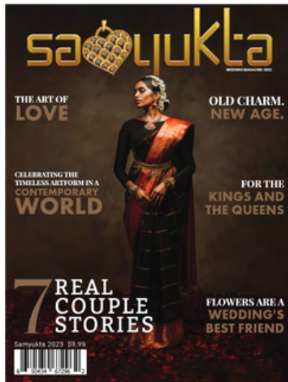
Samyukta Wedding Magazine 2023