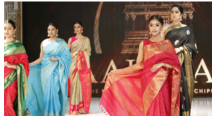
Samyukta Fashion Show 2023