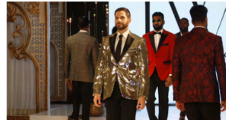
Samyukta Fashion Show 2020