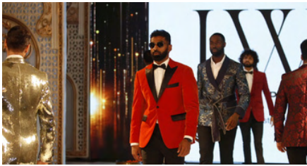
Samyukta Fashion Show 2024