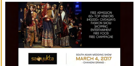
Samyukta Wedding Show 2017