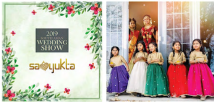
Samyukta Wedding Show 2019