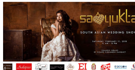
Samyukta Wedding Show 2018