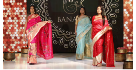
Samyukta Fashion Show 2020