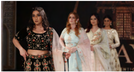
Samyukta Fashion Show 2024