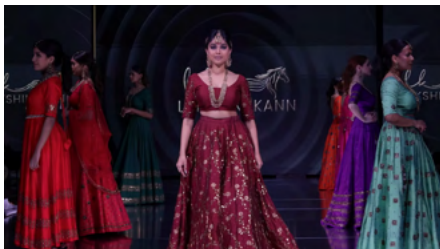
Samyukta Fashion Show 2016