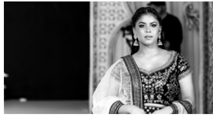
Samyukta Fashion Show 2023