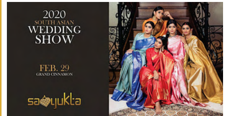
Samyukta Wedding Show 2020