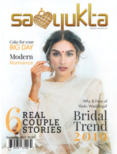
Samyukta Wedding Magazine 2019