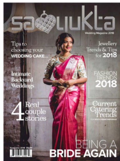
Samyukta Wedding Magazine 2018