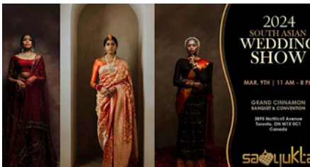
Samyukta Wedding Show 2024