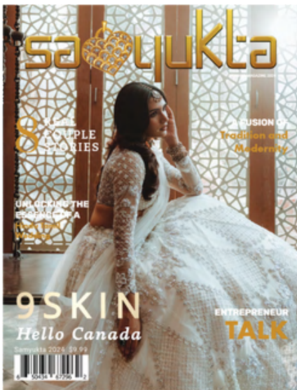
Samyukta Wedding Magazine 2024